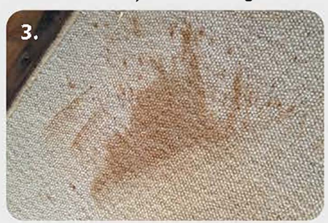
Stain Removal - Attempt stain removal to identified areas with appropriate techniques.