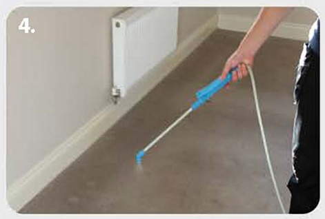
Spray Treatment - Self neutralising and encapsulating. Any soil not absored will crystallise.