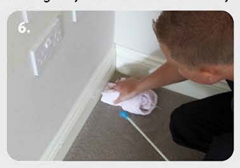
Clean the edges - Clean all edges and hard to reach areas