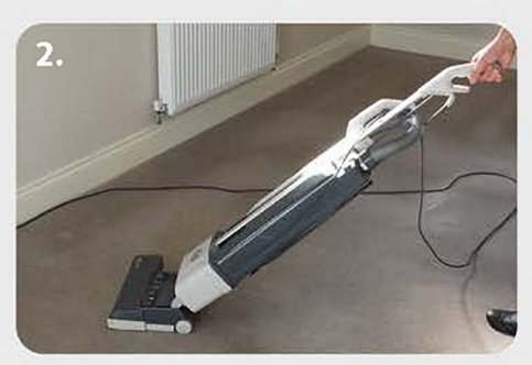
Power Vacuum - Remove all insoluble dust and hairs etc. Move furniture if applicable.