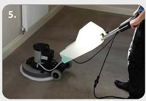
Bonnet Absorption - Absorb and warm carpet fibres to remove as much excess moisture as possible to speed drying.