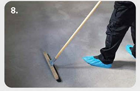
Set pile - Lay fibres flat to speed drying.